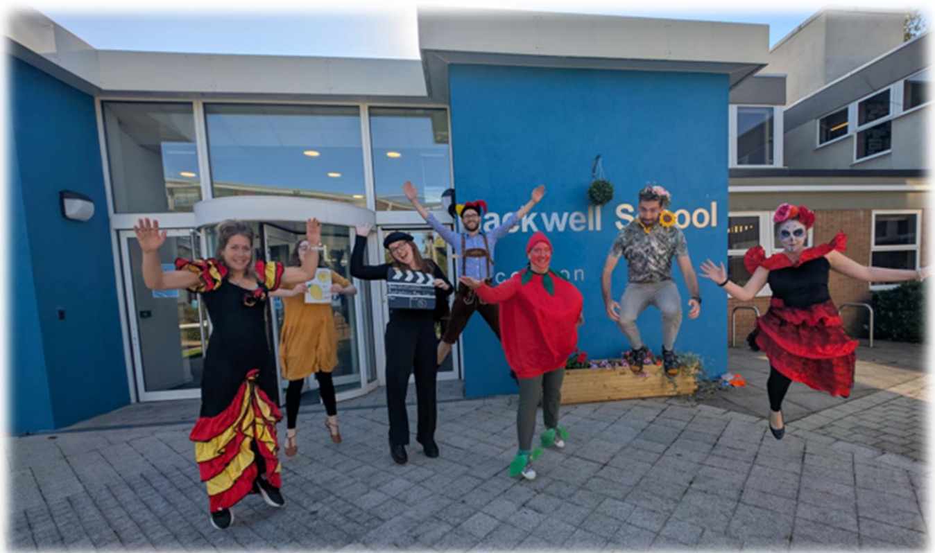
Backwell School MFL staff enjoying a chance to dress up for European Day of Languages