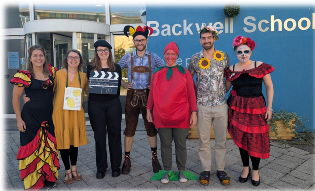
Backwell MFL staff celebrating a selection of European festivals for European Day of languages