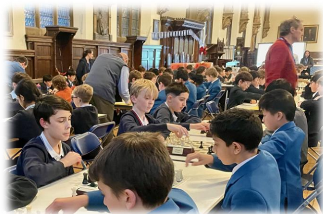
Year 8 chess team regional matches

Year 11 -have focussed on physical health and wellbeing during their tutor time sessions, as well as looking at the influences on close relationships as part of their SMSC lessons.