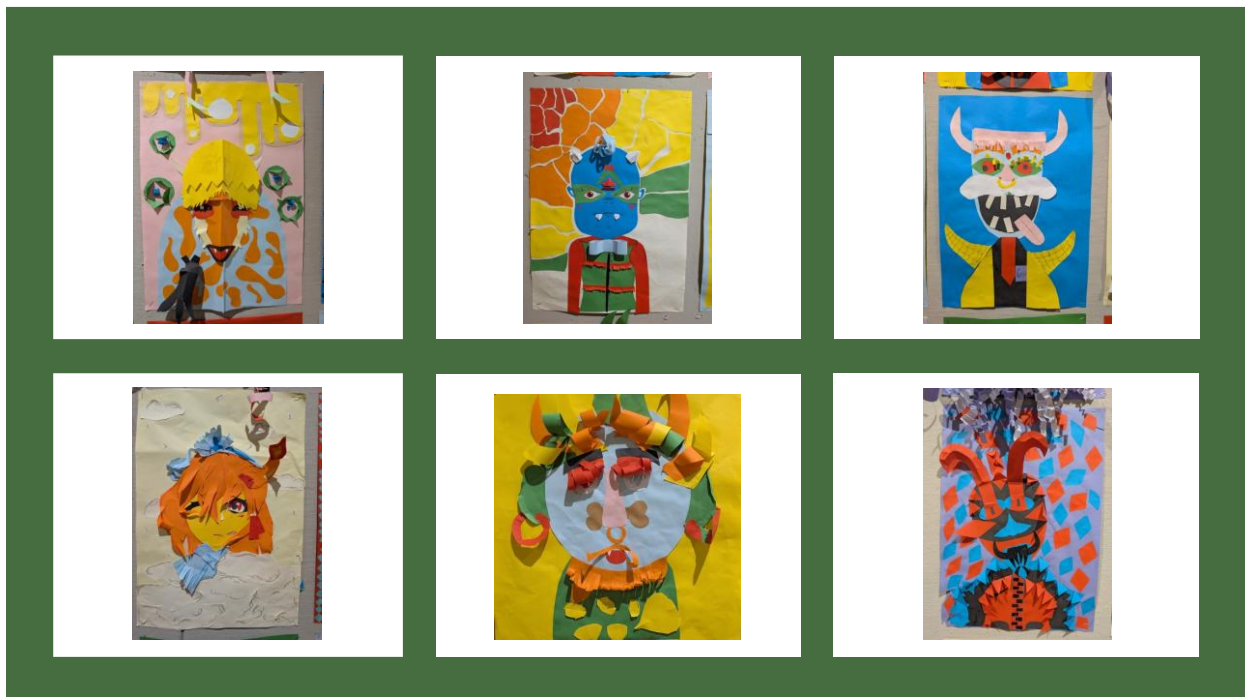
Year 8 Paper Masks