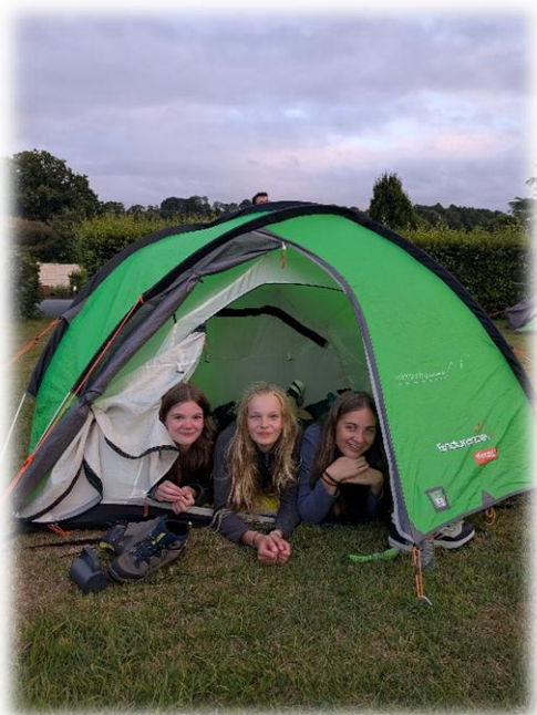
Some of our Year 11 students on a recent DofE Assessed expedition

During Year 12 tutor times students are looking at Relationships, including Consent, Trust and Intimacy and Ending Relationships.